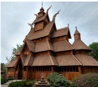
Stave Church at the Scandinavian Heritage Park